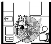
60" turning circle for wheelchairs

Accessible Healthcare RI is a 501(c)3 and Rhode Island Incorporated Non-profit Organization with a mission of: